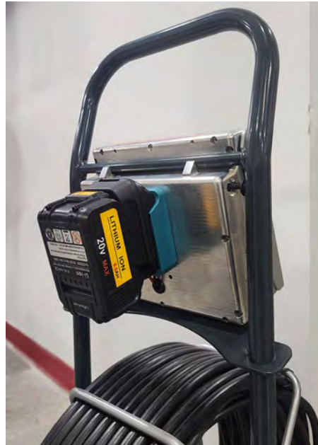
Dewalt with adapter