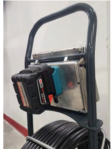
Milwaukee with adapter