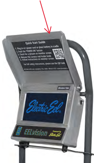
Protective Sunshade/Screen Protector