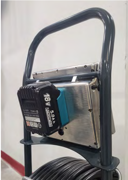
Makita with no adapter