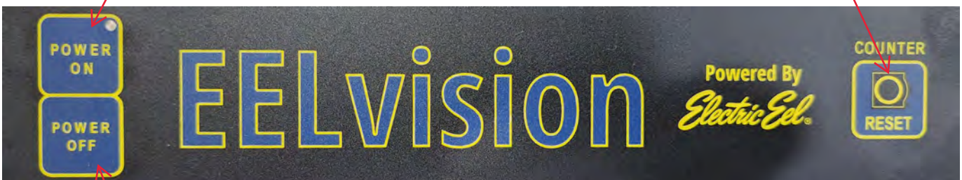
Counter Reset Button